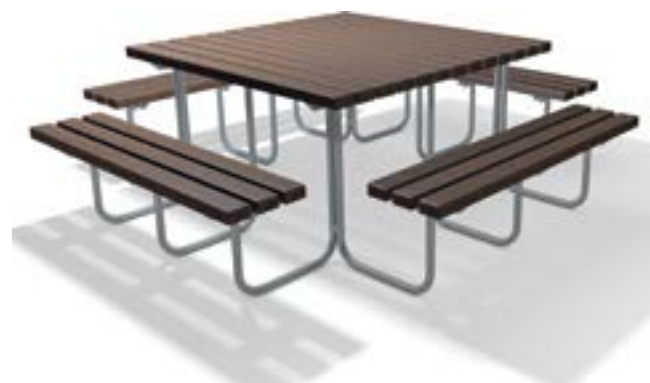
Table and bench in one Durable and dimensionally stable Never paint, varnish or grind again No risk of injury from splinters No annoying mothballing in winter (weatherproof) Fast drying, no water absorption Resistant to vandalism